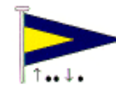
First Substitute General Recall