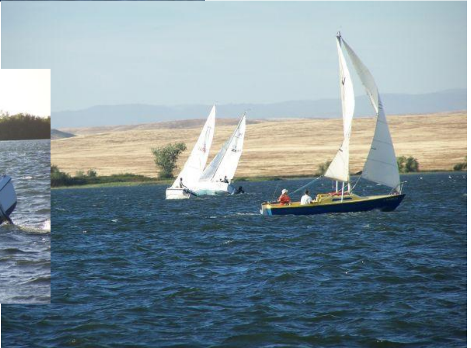
June 2012 Thursday night racing