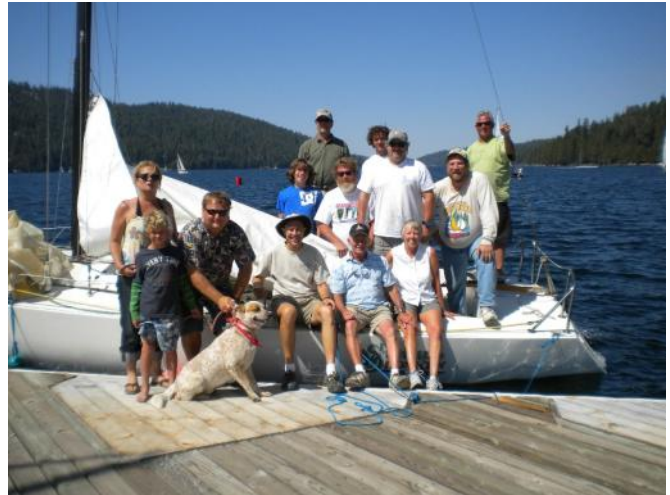
Part of the LYSA Group at a recent High Sierra Regatta. Many smiling faces!